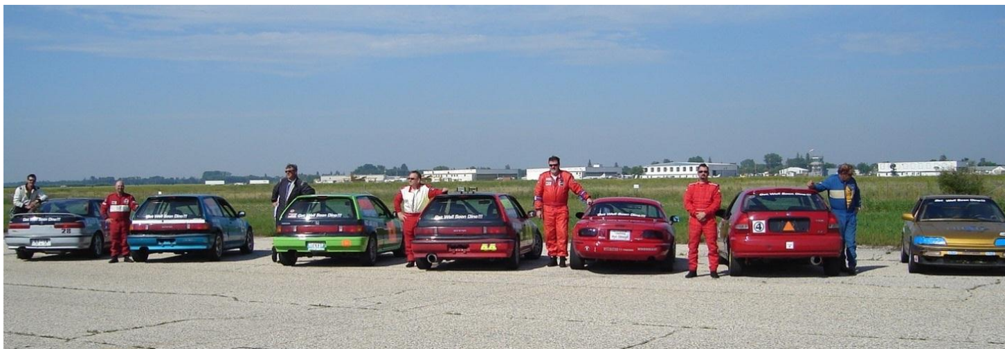
Sedans all showing their “Get Well Soon Dino!!!” decals